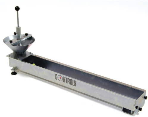
Flow test apparatus for grouts